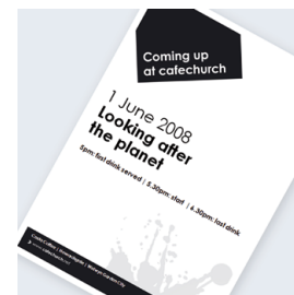
B&W A4/A6 flyer